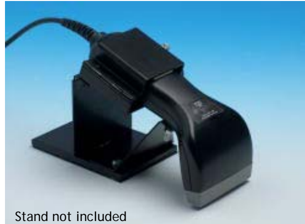
Stand not included

The Axicon Verifier, when used in conjunction with the accurately produced calibration sheet, forms an integral part of your ISO 9000 quality control procedures.